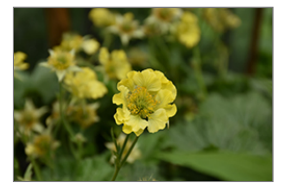
Cocktails Banana Daiquiri Avens flowers