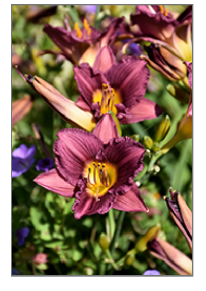
Purple de Oro Daylily flowers