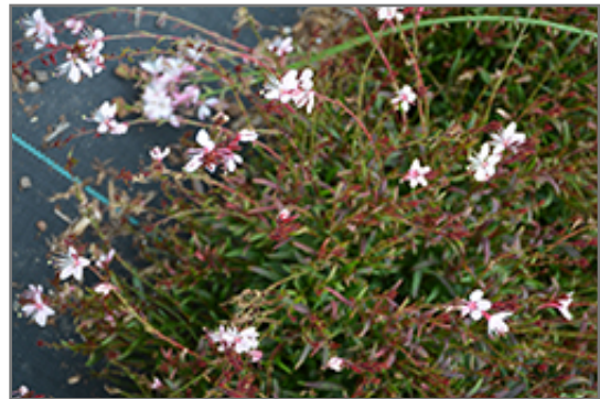
Gaudi Pink Gaura in bloom