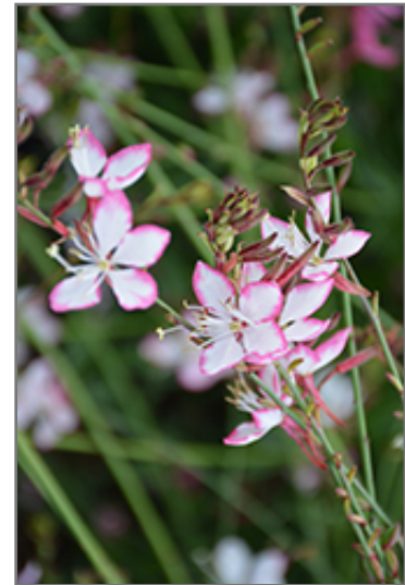
Rosy Jane Gaura flowers

Rosy Jane Gaura is recommended for the following landscape applications;