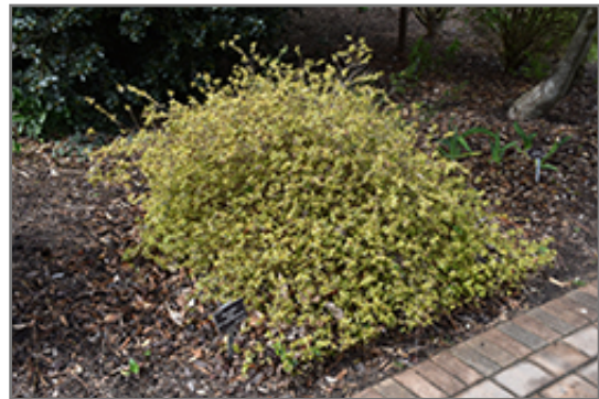
Twist of Orange Glossy Abelia