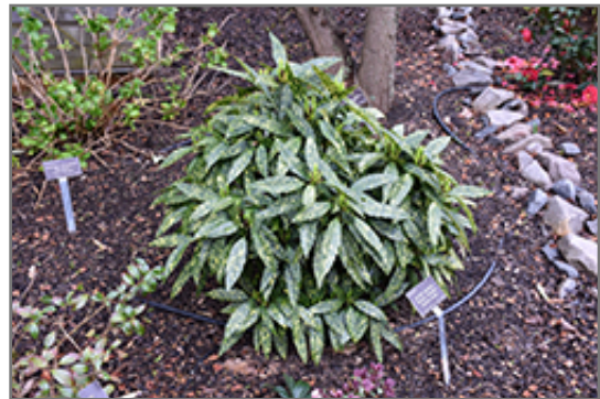
Hosoba Hoshifu Aucuba