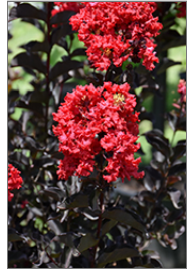
Ebony Fire Crapemyrtle flowers