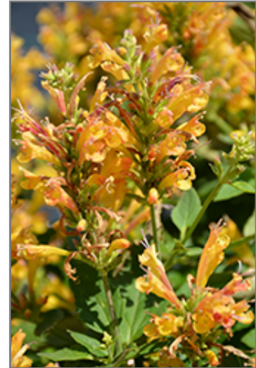
Poquito Butter Yellow Hyssop flowers

Poquito Butter Yellow Hyssop is recommended for the following landscape applications;