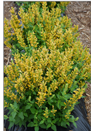
Poquito Butter Yellow Hyssop in bloom