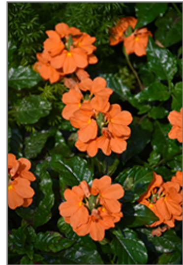
Orange Marmalade Firecracker Plant flowers

This plant does best in full sun to partial shade. It does best in average to evenly moist conditions, but will not tolerate standing water. It is not particular as to soil pH, but grows best in rich soils. It is somewhat tolerant of urban pollution. This is a selected variety of a species not originally from North America. It can be propagated by cuttings; however, as a cultivated variety, be aware that it may be subject to certain restrictions or prohibitions on propagation.