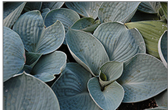
Love Pat Hosta foliage