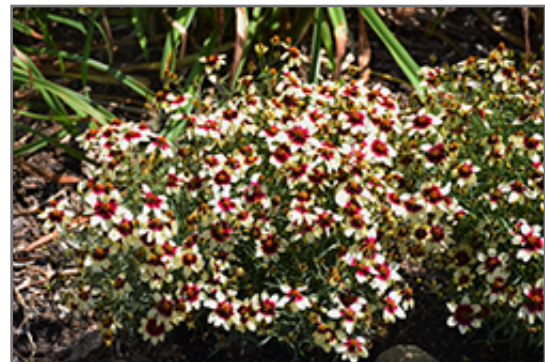
Sizzle And Spice Red Hot Vanilla Tickseed in bloom