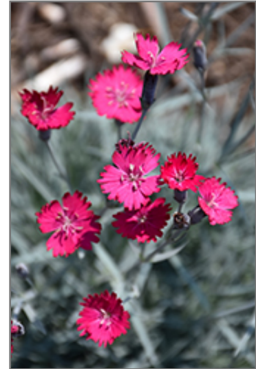
Wicked Witch Pinks flowers

Wicked Witch Pinks is recommended for the following landscape applications;