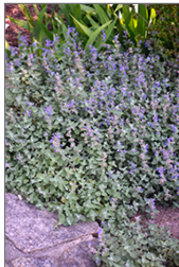
Early Bird Catmint in bloom