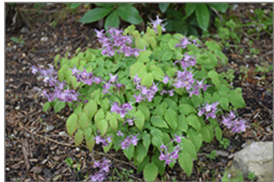
Purple Pixie Bishop's Hat in bloom