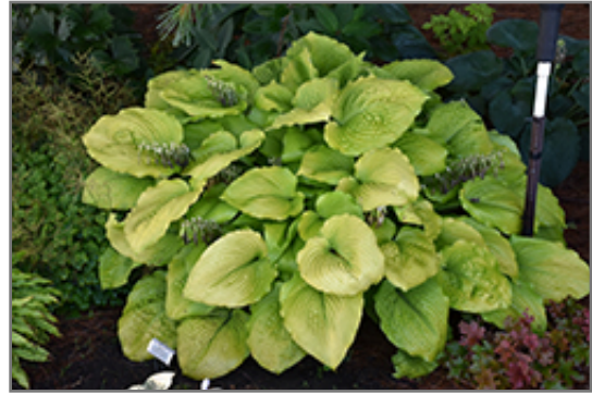
Shadowland Coast to Coast Hosta