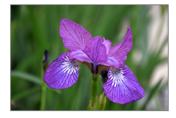
Chilled Wine Siberian Iris flowers