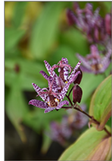
Toad Lily flowers