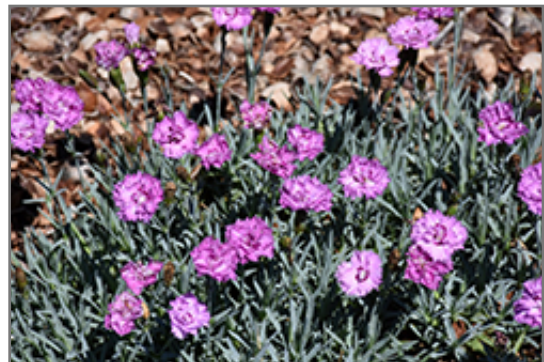
Mountain Frost Silver Strike Pinks flowers