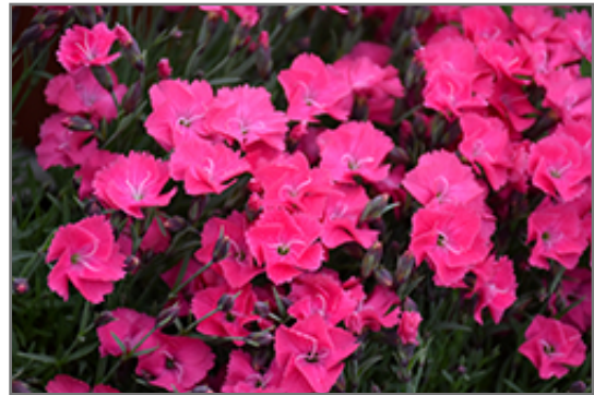
Vivid Bright Light Pinks flowers