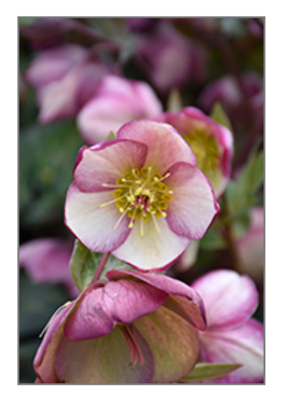
Frostkiss Glenda's Gloss Hellebore flowers