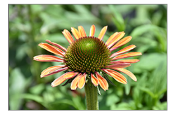
Butterfly Rainbow Marcella Coneflower flowers