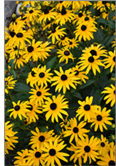
American Gold Rush Coneflower flowers

This is a relatively low maintenance plant, and should be cut back in late fall in preparation for winter. It is a good choice for attracting birds, bees and butterflies to your yard, but is not particularly attractive to deer who tend to leave it alone in favor of tastier treats. It has no significant negative characteristics.