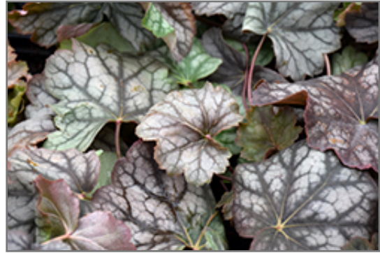
Dale's Strain Coral Bells foliage