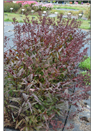
Pocahontas Beard Tongue

This is a relatively low maintenance plant, and is best cleaned up in early spring before it resumes active growth for the season. It is a good choice for attracting butterflies to your yard. It has no significant negative characteristics.