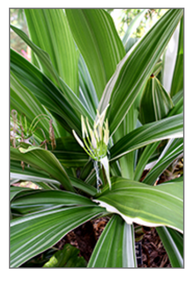
Variegated Giant Crinum Lily flowers