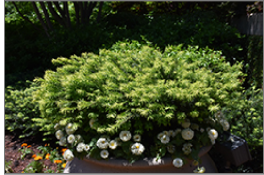
Hedgehog Japanese Plum Yew

Hedgehog Japanese Plum Yew is recommended for the following landscape applications;