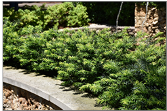
Hedgehog Japanese Plum Yew