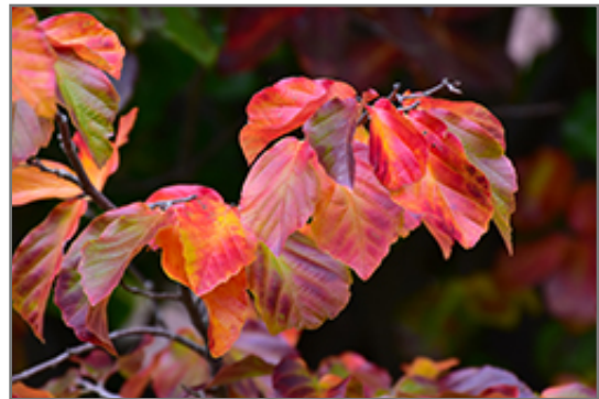
Persian Parrotia in fall