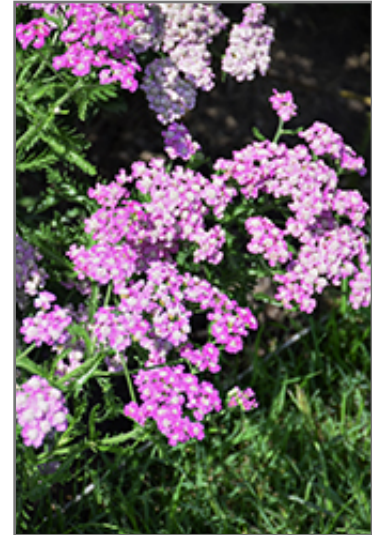
Firefly Amethyst Yarrow flowers

Firefly Amethyst Yarrow is recommended for the following landscape applications;