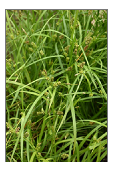
Creek Sedge flowers

A robust, semi-evergreen variety producing narrow, shiny foliage and scaly green flower spikes in late spring; this attractive, shaggy, mounded sedge is perfect for woodland or shade gardens that have moist to wet soil