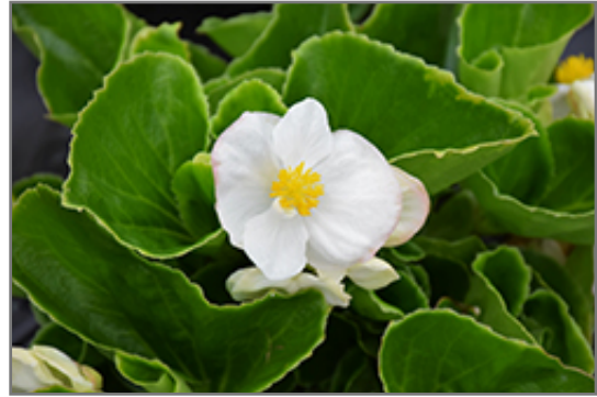
Tophat White Begonia flowers

Tophat White Begonia is recommended for the following landscape applications;