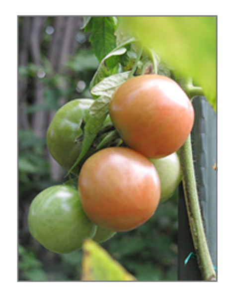
Better Boy Tomato fruit