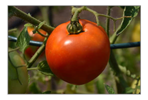
Better Boy Tomato fruit