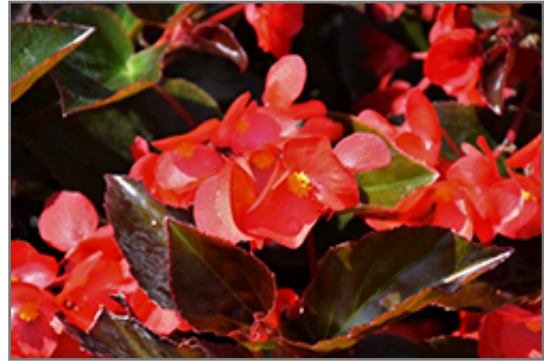
Big DeLuXXE Red Bronze Leaf Begonia flowers