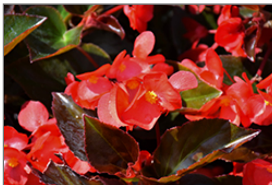
Big DeLuXXE Red Bronze Leaf Begonia flowers