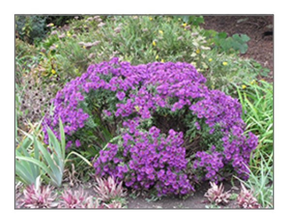
Believer Purple Aster in bloom

Believer Purple Aster is recommended for the following landscape applications;