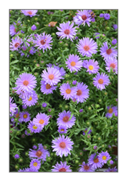
Believer Purple Aster flowers