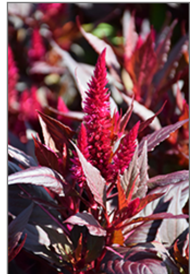
Kelos Fire Magenta Celosia flowers