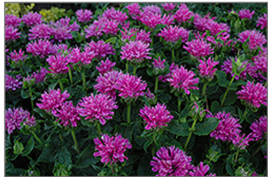
Petite Delight Beebalm flowers