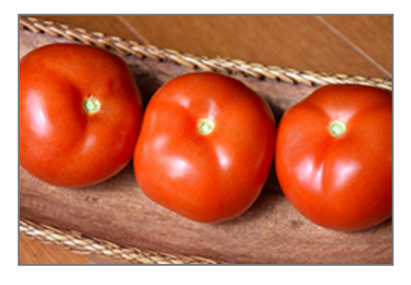
Rutgers Tomato fruit