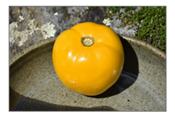
Lemon Boy Tomato fruit