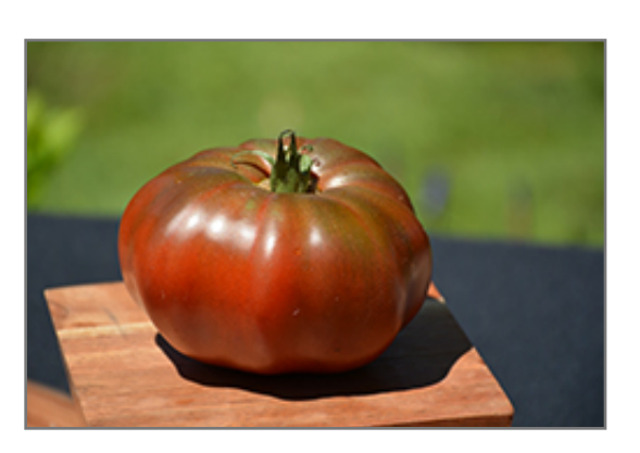
Black Krim Tomato fruit

Black Krim Tomato will grow to be about 4 feet tall at maturity, with a spread of 18 inches. When planted in rows, individual plants should be spaced approximately 24 inches apart. Because of its vigorous growth habit, it may require staking or supplemental support. This fast-growing vegetable plant is an annual, which means that it will grow for one season in your garden and then die after producing a crop.