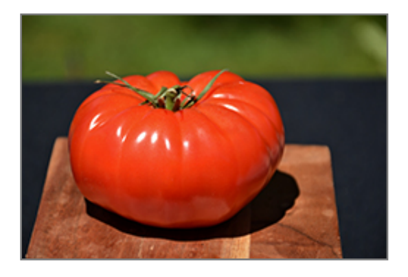
Champion Tomato fruit