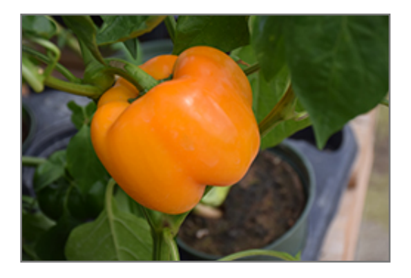
Early Sunsation Pepper fruit