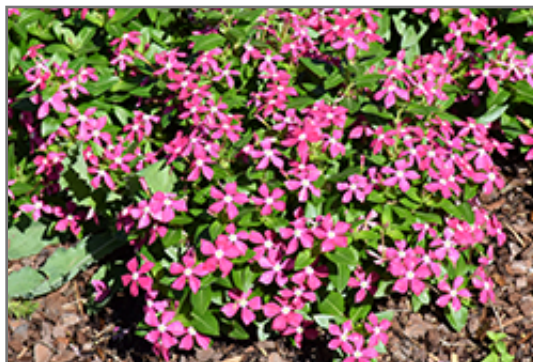
Soiree Kawaii Red Vinca in bloom