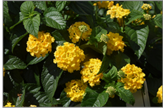
Lucky Yellow Lantana flowers