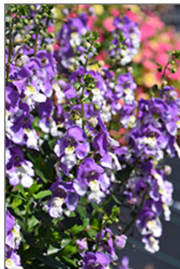
Alonia Big Bicolor Purple Angelonia flowers

Alonia Big Bicolor Purple Angelonia is recommended for the following landscape applications;