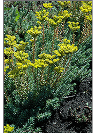
Blue Spruce Stonecrop flowers

Blue Spruce Stonecrop is smothered in stunning gold star-shaped flowers at the ends of the stems from early to mid summer. Its attractive succulent needle-like leaves remain silvery blue in color throughout the season.