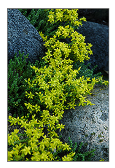
Six Row Stonecrop flowers