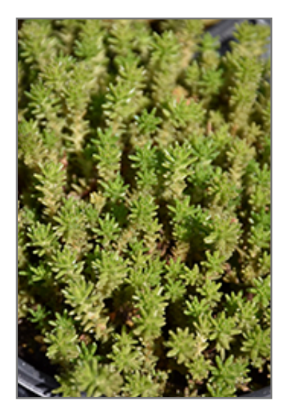
Six Row Stonecrop foliage

This plant does best in full sun to partial shade. It prefers dry to average moisture levels with very well-drained soil, and will often die in standing water. It is considered to be drought-tolerant, and thus makes an ideal choice for a low-water garden or xeriscape application. It is not particular as to soil pH, but grows best in poor soils, and is able to handle environmental salt. It is highly tolerant of urban pollution and will even thrive in inner city environments. This species is not originally from North America. It can be propagated by division.