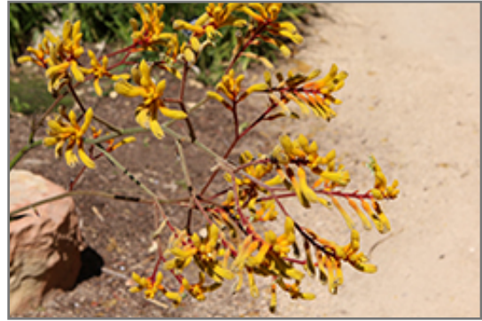
Yellow Gem Kangaroo Paw flowers

Yellow Gem Kangaroo Paw is recommended for the following landscape applications;