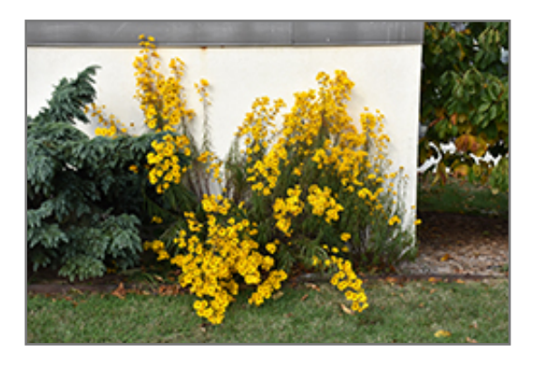
Narrow-leaved Sunflower in bloom