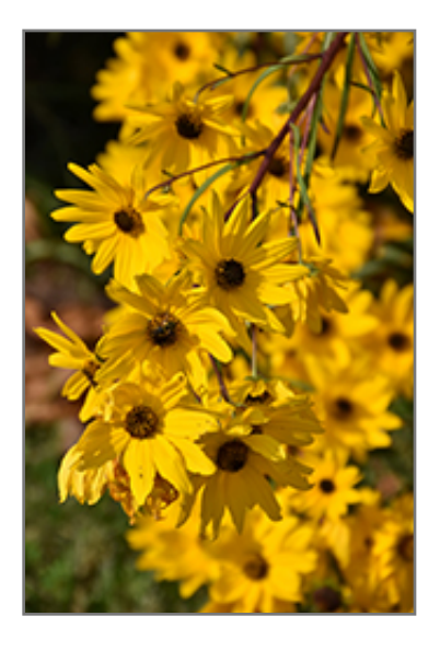
Narrow-leaved Sunflower flowers

Narrow-leaved Sunflower is an herbaceous perennial with an upright spreading habit of growth. Its relatively fine texture sets it apart from other garden plants with less refined foliage.