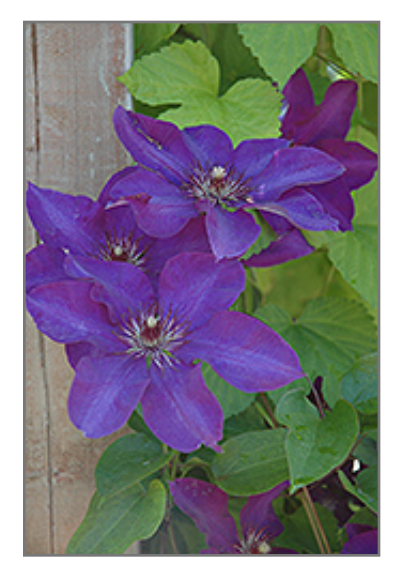
The President Clematis flowers