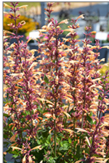
Meant To Bee Queen Nectarine Anise Hyssop flowers

Meant To Bee Queen Nectarine Anise Hyssop is recommended for the following landscape applications;