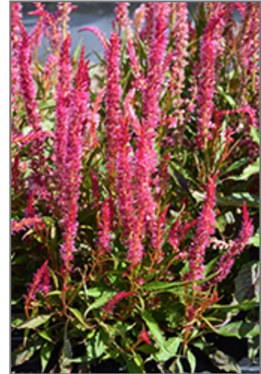
Kelos Atomic Celosia flowers

Kelos Atomic Celosia is recommended for the following landscape applications;